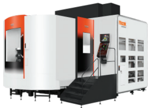
Manes Machine utilizes a diverse group of 5-Axis CNC machines including the Mazak Vortex e-1250V/8